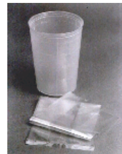
Cup & Liners for Spray Guns